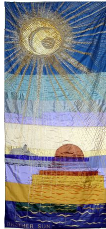
BROTHER SUN – The sun over the outline of Assisi