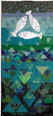
TRINITY – Three Fishes, an early Christian symbol