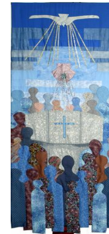
BAPTISM – The Dove and water of baptism