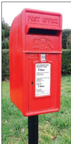
QEII pillar post box, Lymington, 2023.