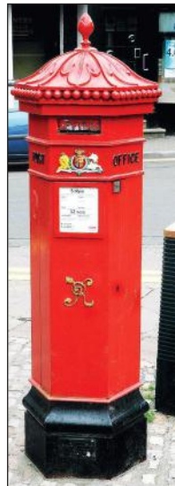
Hexagonal 1860s Penfold post box in Monmouth, 2011.