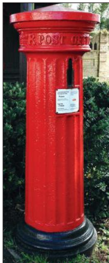
Victorian fluted design from the 1850s, Mudeford, 2017.