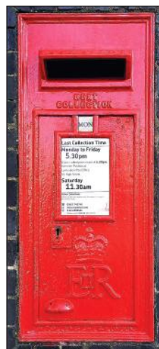
QEII wall post box at Lymington Town Station, 2023.