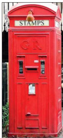
George V 'phone box with integral stamp dispensing machines and post box. Preserved at the East Somerset Railway, 2018.