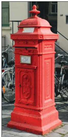
An early square post box seen in Brugges, 2004.