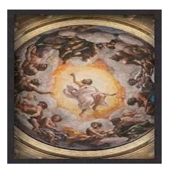
Correggio: The Ascension of Christ

Note that both interpretations of the Ascension can be right.